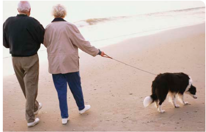
After your pacemaker is put in, you'll be able to resume physical activities when your doctor says it's OK.